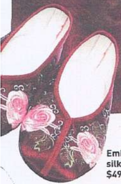
Embroidered silk shoes, $49.90.