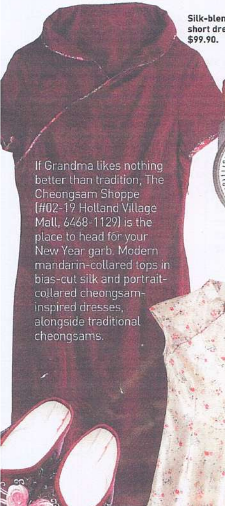
Silk-blend short dress, $99.90.

Cheongsam-inspired wear, sporty watches and sticky bras.