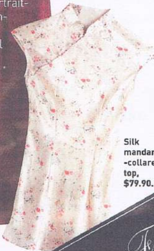
Silk mandarin-collared top, $79.90.

Nautica's seafaring inspiration and modern-classic looks are nicely translated into its watch collection, available at Tangs. We predict that both the oversized Clipper with its broad cuff and the BFC's retro appeal are certain to sail out of the shop.